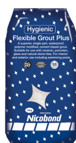
Nicobond Flexible Grout Plus