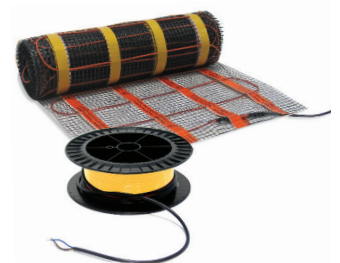
Nicobond Undertile Heating