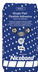
Nicobond Single Part Flexible Adhesive