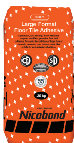
Nicobond Large Format Floor Tile Adhesive