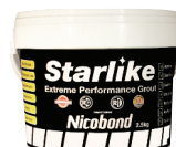
Nicobond Starlike Extreme Performance Grout