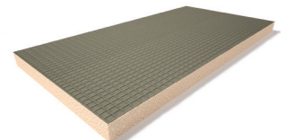
Nicobond Tile Backer Board