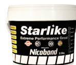
Nicobond Starlike Extreme Performance Grout