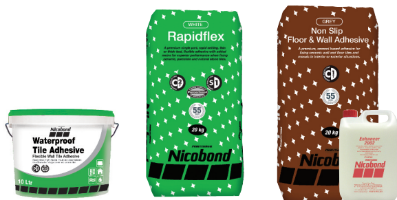
Nicobond Waterproof Tile Adhesive