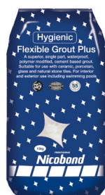
Nicobond Flexible Grout Plus