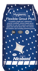
Nicobond Flexible Grout Plus