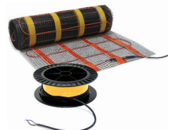
Nicobond Undertile Heating