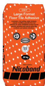
Nicobond Large Format Floor Tile Adhesive