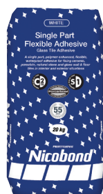
Nicobond Single Part Flexible Adhesive