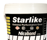
Nicobond Starlike Extreme Performance Grout