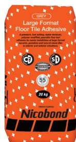
Nicobond Large Format Floor Tile Adhesive