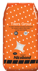
Nicobond Tilers Grout