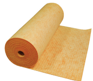
Nicobond D-Mat 3L