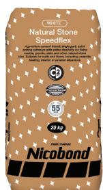
Nicobond Natural Stone Speedflex