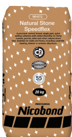
Nicobond Natural Stone Speedflex