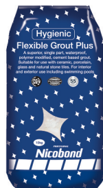
Nicobond Flexible Grout Plus