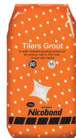
Nicobond Tilers Grout