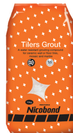
Nicobond Tilers Grout