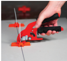
5. Nicobond Professional Levelling System