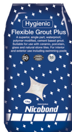
Nicobond Flexible Grout Plus