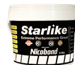
Nicobond Starlike Extreme Performance Grout