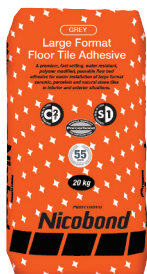
Nicobond Large Format Floor Tile Adhesive