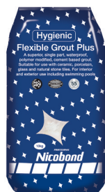
Nicobond Flexible Grout Plus