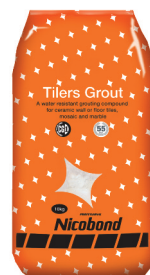
Nicobond Tilers Grout