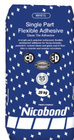
Nicobond Single Part Flexible Adhesive