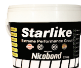
Nicobond Starlike Extreme Performance Grout