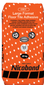
Nicobond Large Format Floor Tile Adhesive