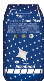
Nicobond Flexible Grout Plus